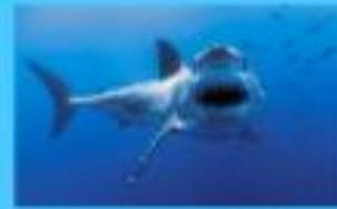
Great white sharks